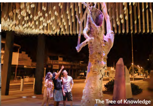
The Tree of Knowledge