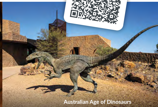
Australian Age of Dinosaurs