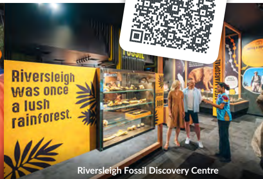
Riversleigh Fossil Discovery Centre