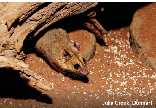
Julia Creek, Dunnart