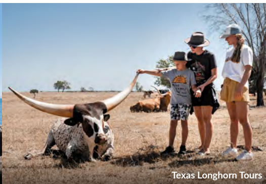
Texas Longhorn Tours