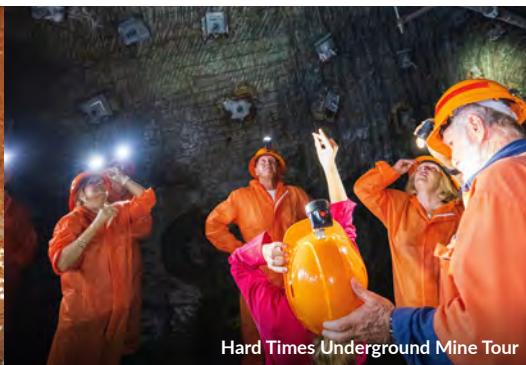
Hard Times Underground Mine Tour