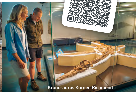
Kronosaurus Korner, Richmond