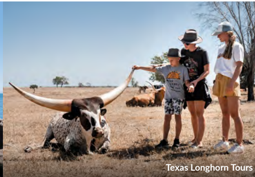
Texas Longhorn Tours