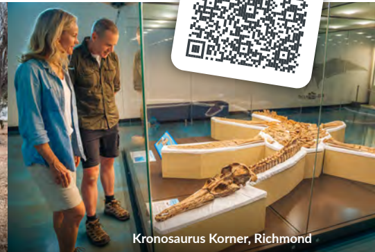
Kronosaurus Korner, Richmond