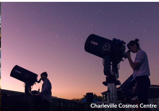
Charleville Cosmos Centre