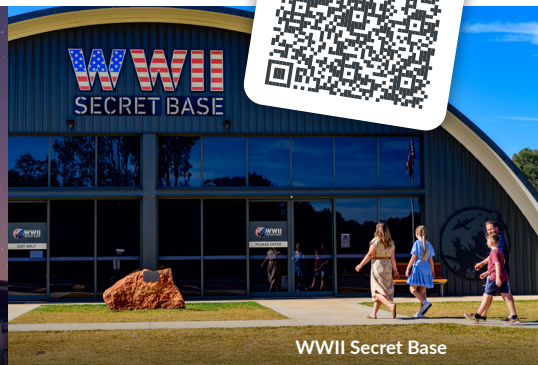
WWII Secret Base